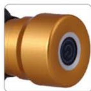
Touch switch Auto power-off