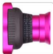
Wide diopter range High precision adjustment